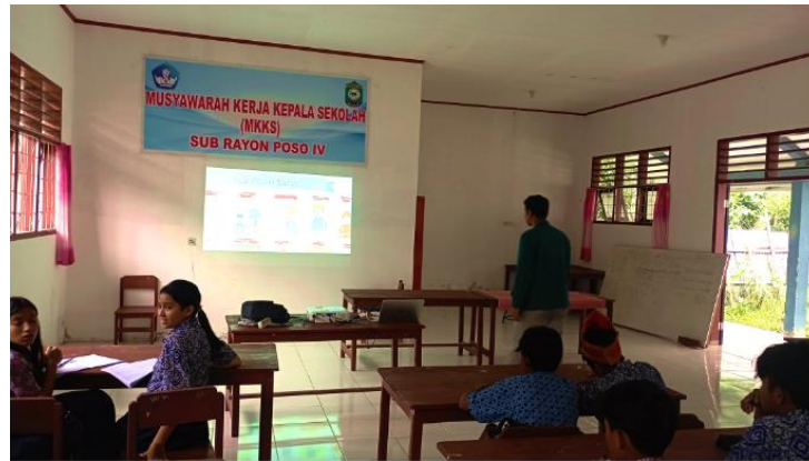
Figure 1. Introducing the Prototype

In this phase, the team introduced this prototype to the 10 students who volunteered in the pilot project.